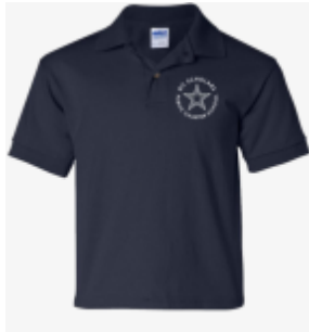
5 th – 8 th Grade Navy Blue Polo

See below for the uniform your MS scholar should wear for the school year 2019-20